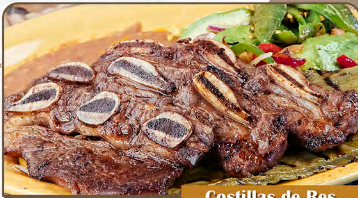
Costillas de Res

A signature dish from Jalisco. Tender slow roasted beef cooked in its own broth with special spices. Definitely rica!!!! 20.75