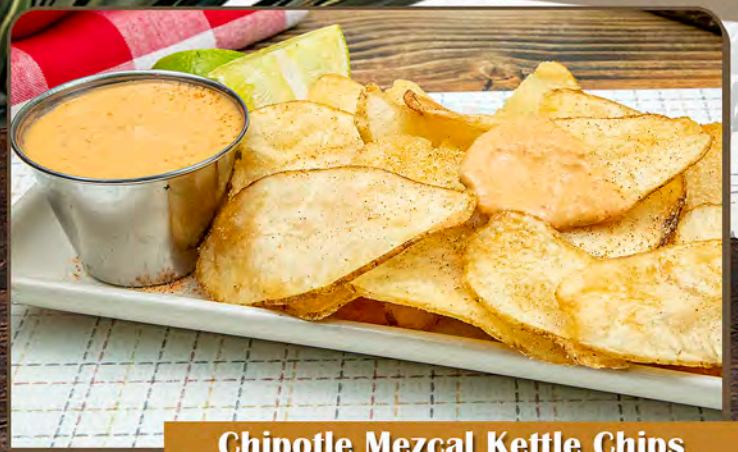
Chipotle Mezcal Kettle Chips