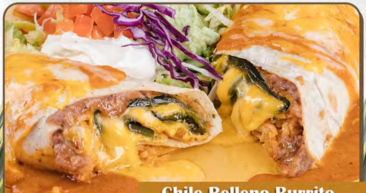
Chile Relleno Burrito