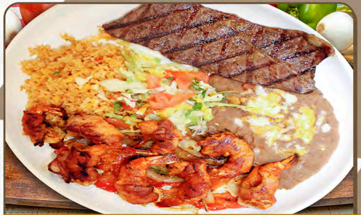
Carne Asada & Bacon Wrapped Prawns