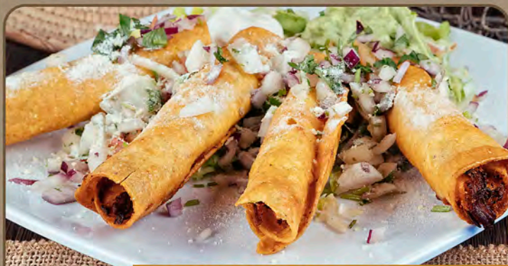
Rolled Up Chicken Taquitos

Corn tortillas filled with chorizo infused refried beans, toasted over the charbroiler topped with cabbage and cilantro. 12.75