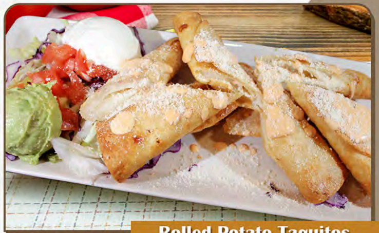
Rolled Potato Taquitos