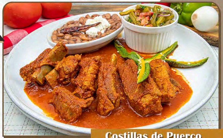
Costillas de Puerco