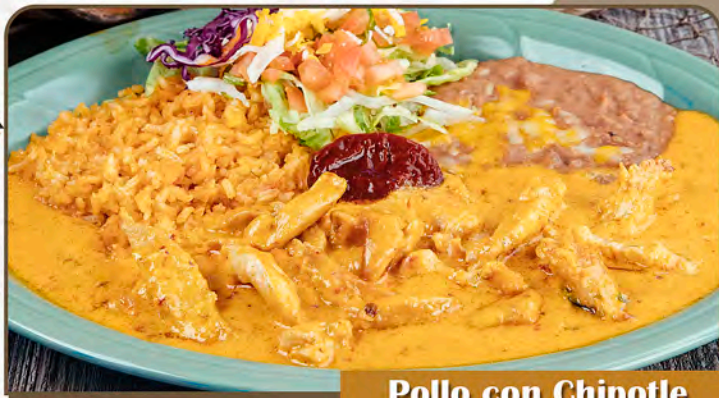
Pollo con Chipotle

Delicious charcoal chicken breast covered in our new creamy poblano pepper sauce topped with fundido mozzarella cheese. 19.99