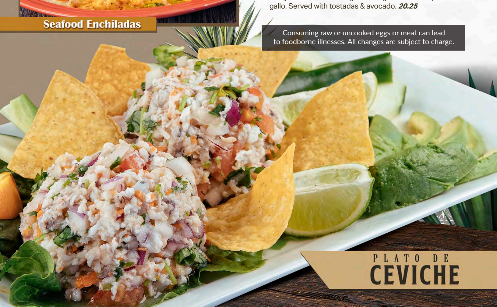
PLATO DE CEVICHE

Consuming raw or uncooked eggs or meat can lead to foodborne illnesses. All changes are subject to charge.