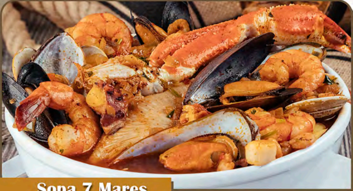
Sopa 7 Mares