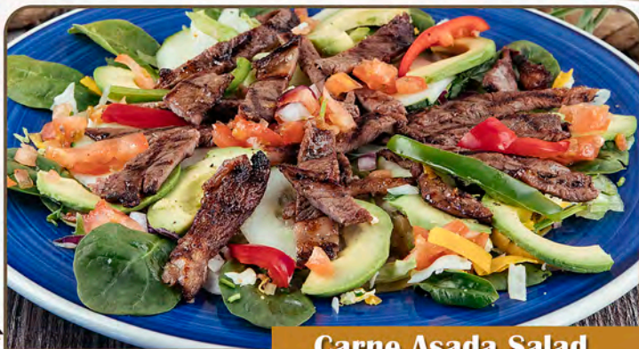
Carne Asada Salad