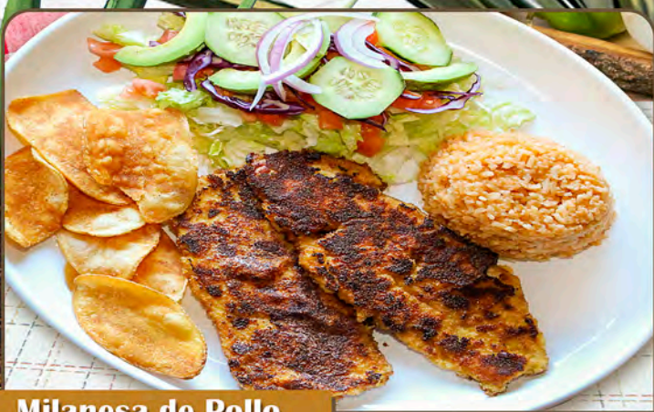
Milanesa de Pollo